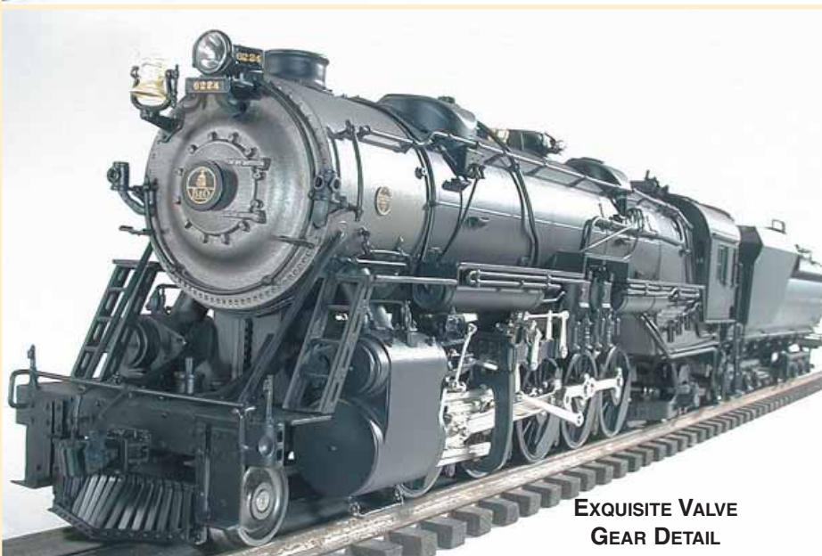
EXQUISITE VALVE GEAR DETAIL