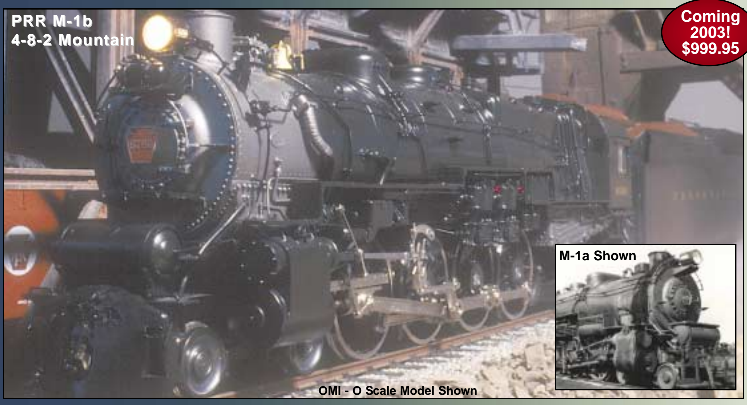
To own "A Piece of History" order today! Call your dealer or 1-800-3RD-RAIL. Visit us on the web at www.3rdrail.com