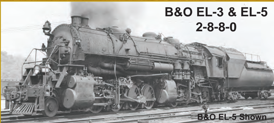
B&O EL-5 Shown

Built for main-line service, these HUGE articulateds (2-8-8-0) were delivered in 4 batches over a 20 year period. Sunset Models is going to produce a model of the EL-3 as compound Mallets (With Huge Low Pressure Front Cylinders) as they were pre-1927, and the EL-5 as a simple-expansion 4 cylinder locomotive as they ran post-1927. Your reservation is what makes these projects happen, so if you want one, don't just sit there, reserve one TODAY!!!