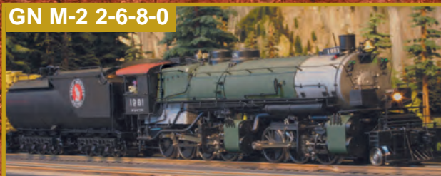
GN M-2 2-6-8-0