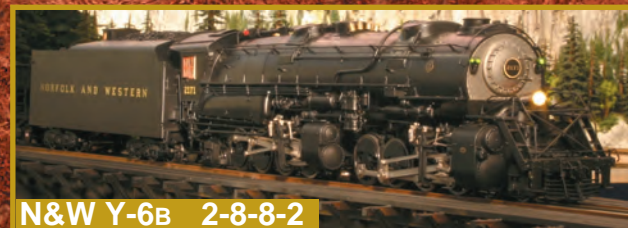
N&W Y-6B 2-8-8-2

LIONEL TMCC & RAILSOUNDS - 2/4 SYNC CHUFF N' PUFF ERR CRUISE CONTROL - Get One While Supply Lasts