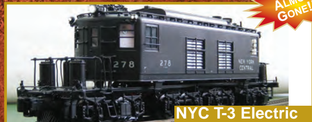
NYC T-3 Electric