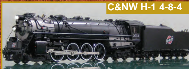
C&NW H-1 4-8-4