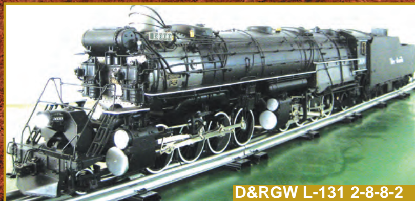
D&RGW L-131 2-8-8-2

LIONEL TMCC & RAILSOUNDS - 2/4 SYNC CHUFF N' PUFF ERR CRUISE CONTROL - Get One While Supply Lasts