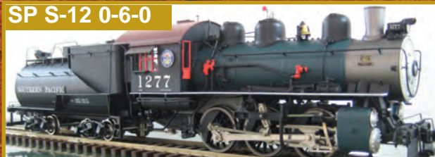
SP S-12 0-6-0