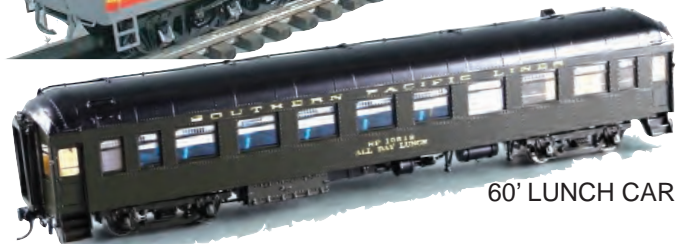
60' LUNCH CAR

Build Your Post War Commuter Train: 68" coupler to coupler, (17" O SCALE). Harriman Coach, Baggage, RPO, Lunch Car and Business Car with open Observation Platform. Available in variety of roads and livery. These super detailed cars will come with full underbody detail, "Anti Flicker" overhead LED lighting and passenger interior with figures flush fitting windows, close coupling and highly detailed die cast trucks.