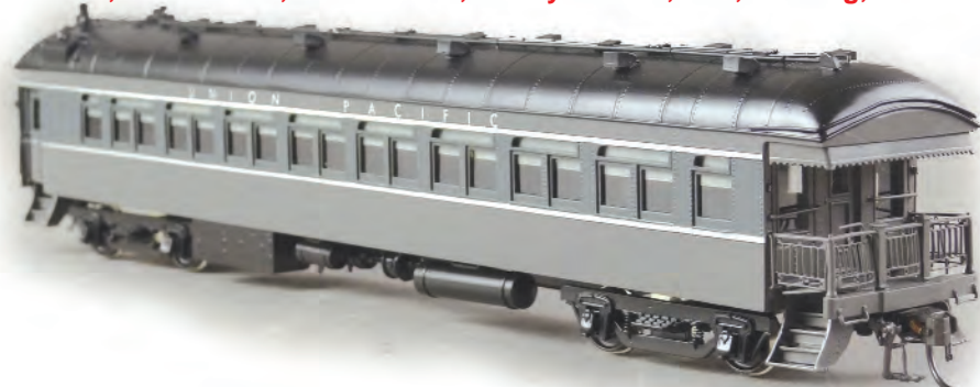
60' BUSINESS OBSERVATION

SP Green / Two Tone Grey, UP Two Tone Grey / Yellow, IC, CB&Q C&NW, Rock Island, Lackawanna, Jersey Central, Erie, Reading, SF