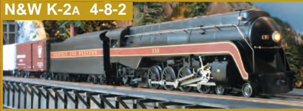
N&W K-2A 4-8-2

EMAIL FOR FASTEST SERVICE - SALES@3RDRAIL.COM