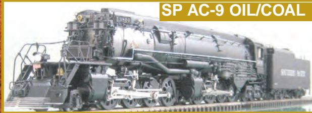
SP AC-9 OIL/COAL