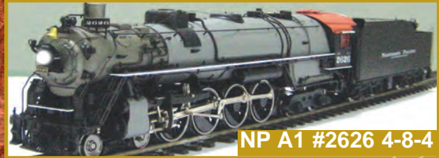
NP A1 #2626 4-8-4