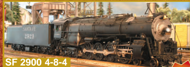
SF 2900 4-8-4