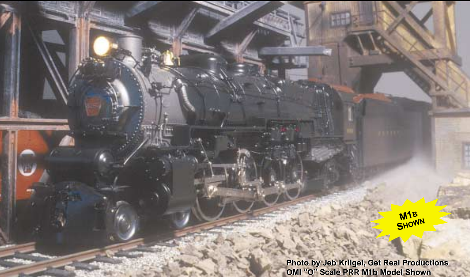
OMI "O" Scale PRR M1b Model Shown