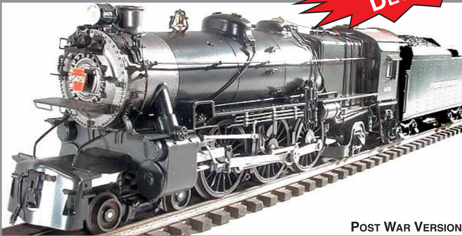
POST WAR VERSION