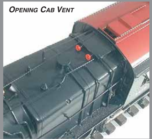
OPENING CAB VENT

The High Iron Division of Sunset Models has produced the first in a series of affordable, superior detailed PRR K4 all Brass models in very limited quantities (120 2R, 250 3R). The PRR K4 comes with all of the features that have made Sunset's models so desirable!