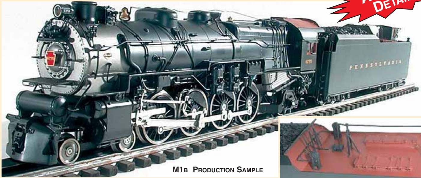
M1B PRODUCTION SAMPLE